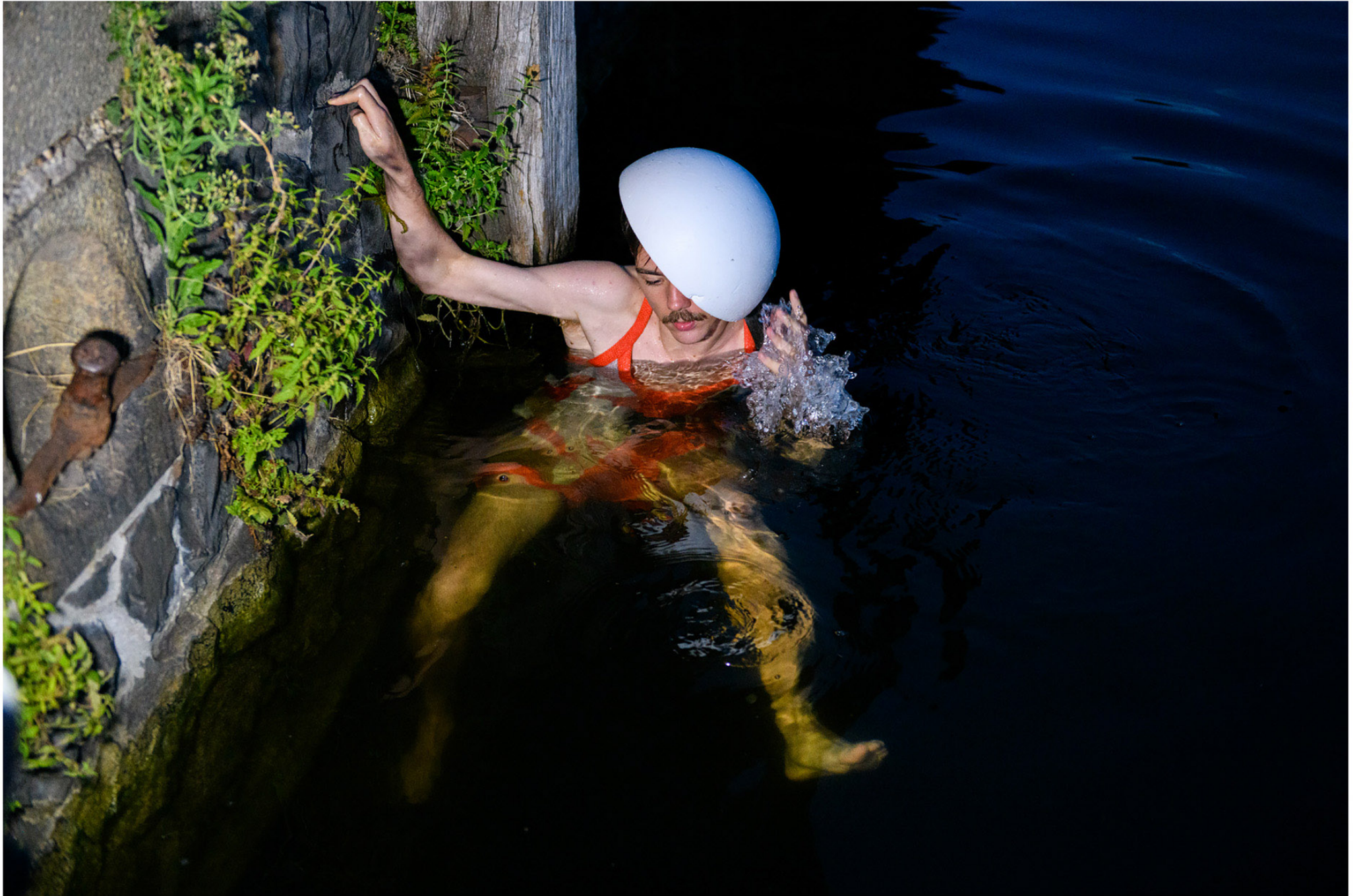
It is part XIX of an ensemble, and this ensemble is no longer necessarily ceremonial, 2020 performance in public space, Tilburg