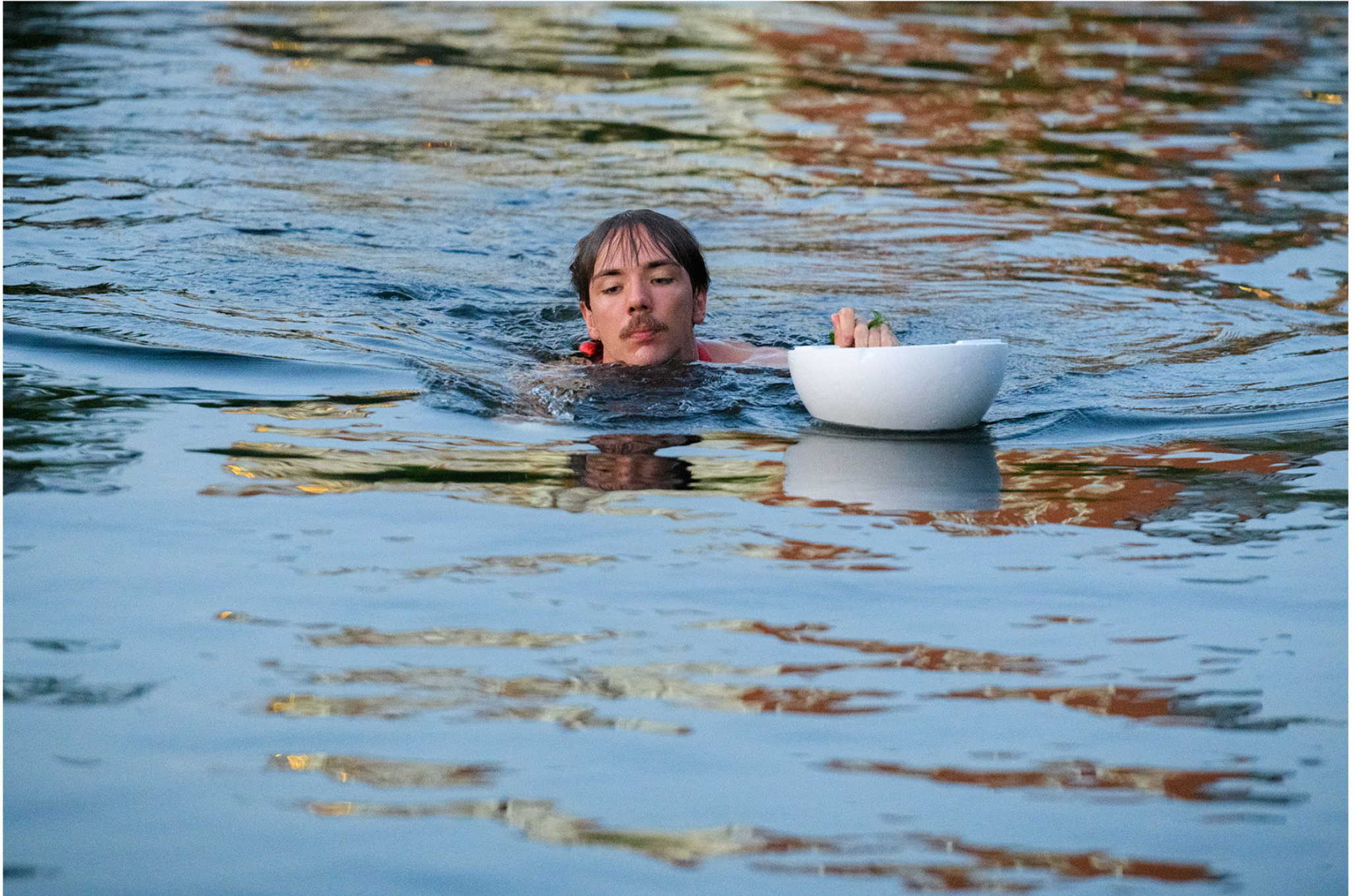
It is part XIX of an ensemble, and this ensemble is no longer necessarily ceremonial, 2020 performance in public space, Tilburg