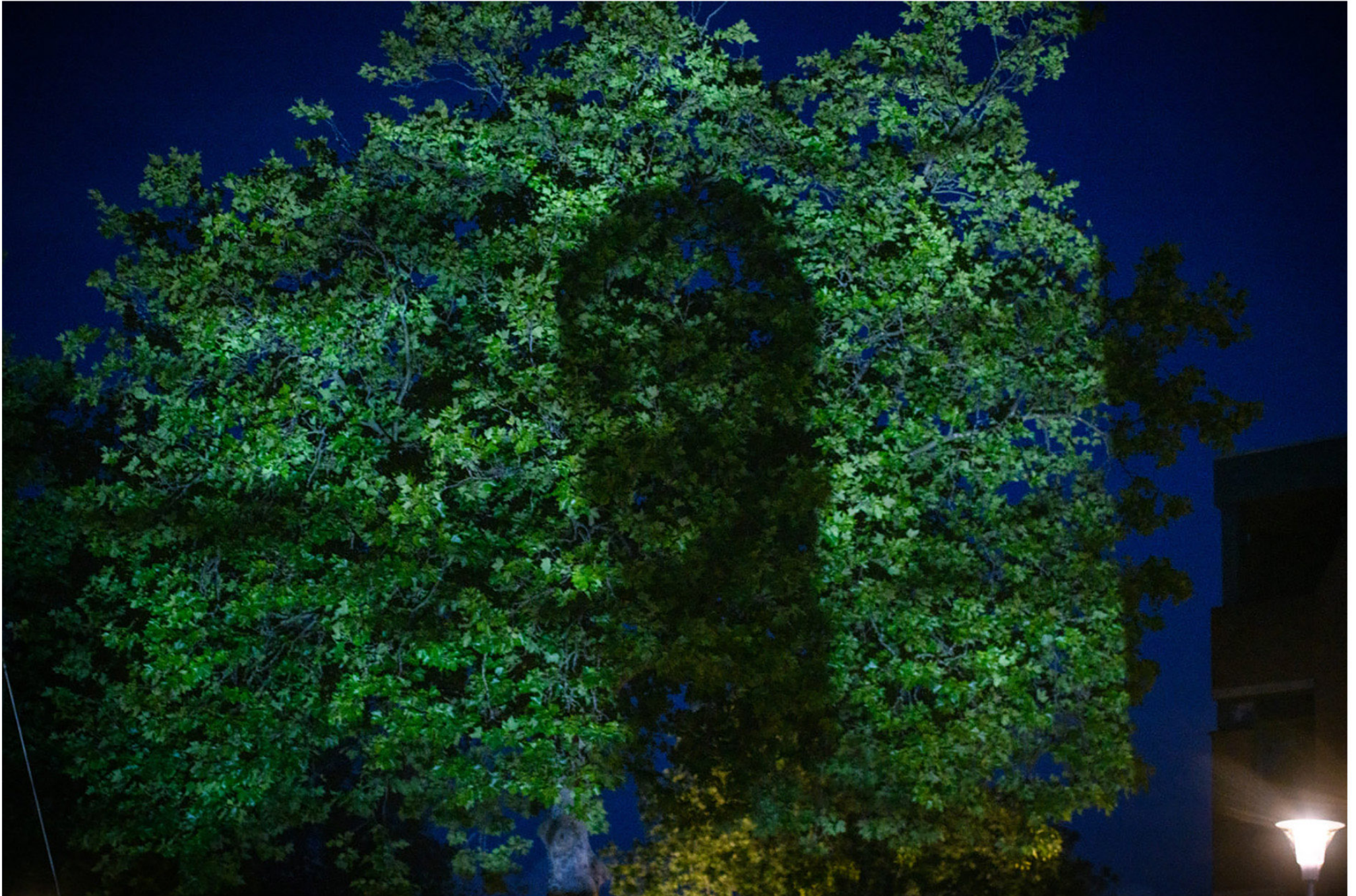
It is part XIX of an ensemble, and this ensemble is no longer necessarily ceremonial, 2020 performance in public space, Tilburg