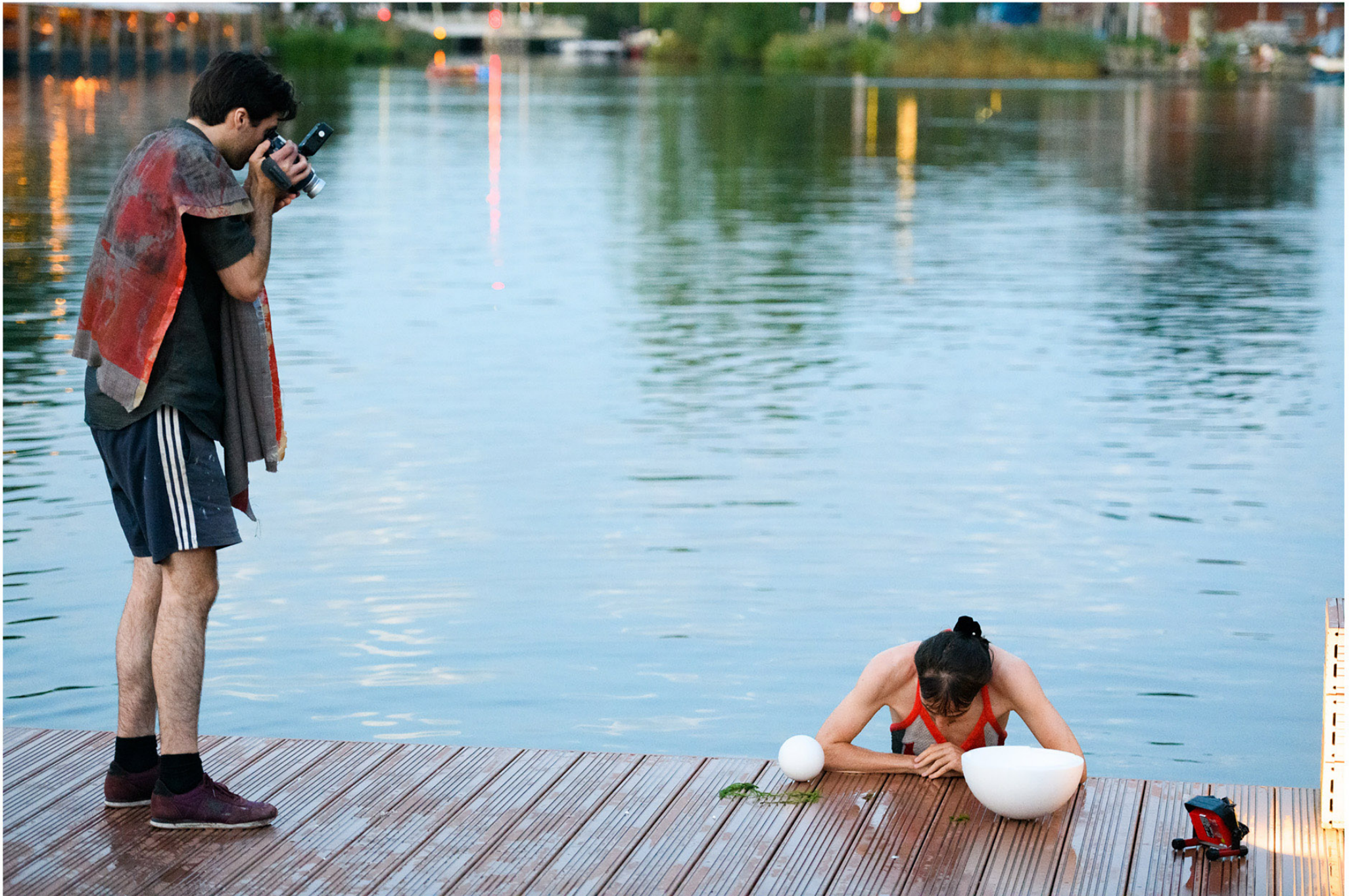
It is part XIX of an ensemble, and this ensemble is no longer necessarily ceremonial, 2020 performance in public space, Tilburg