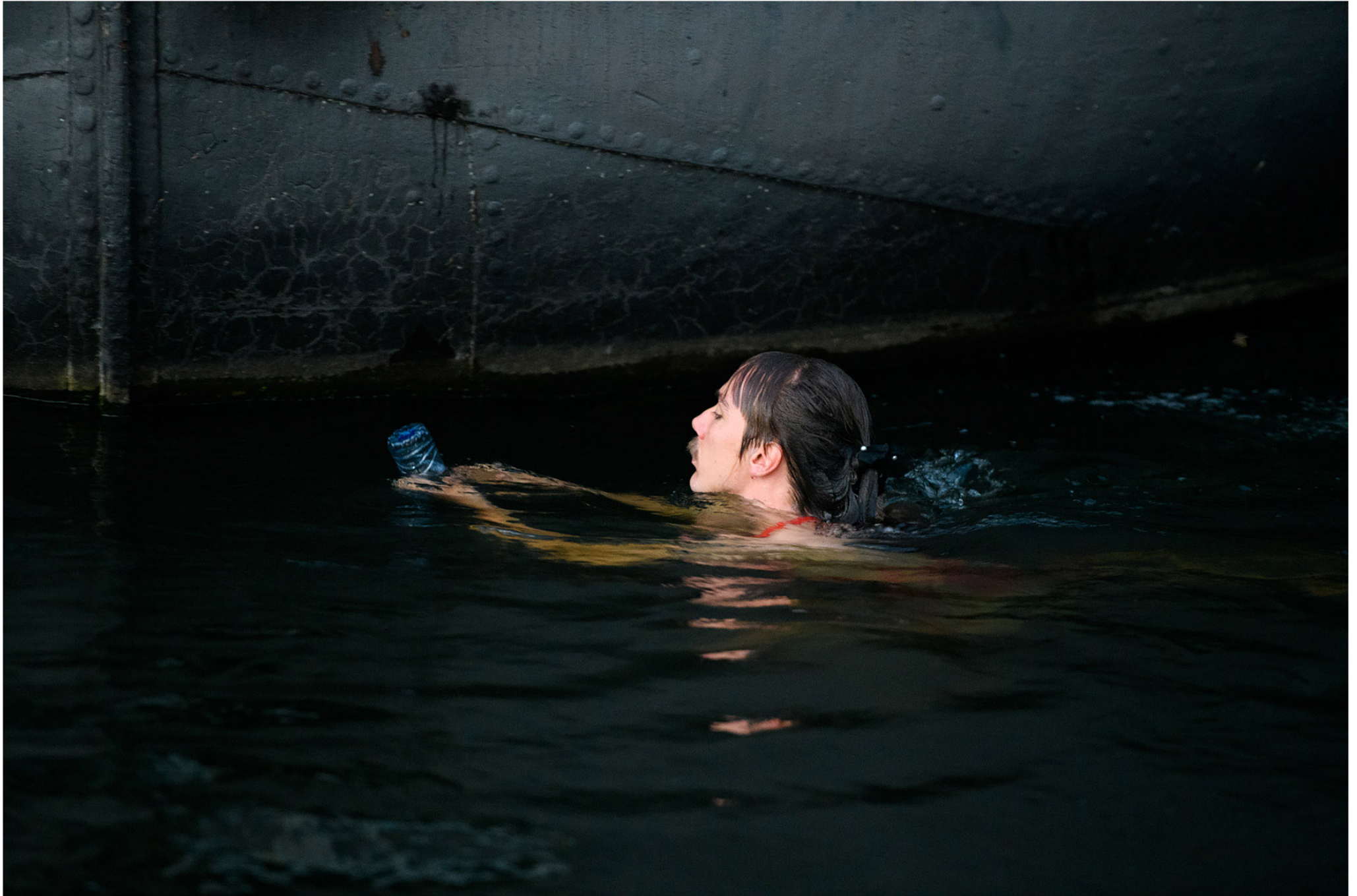
It is part XIX of an ensemble, and this ensemble is no longer necessarily ceremonial, 2020 performance in public space, Tilburg