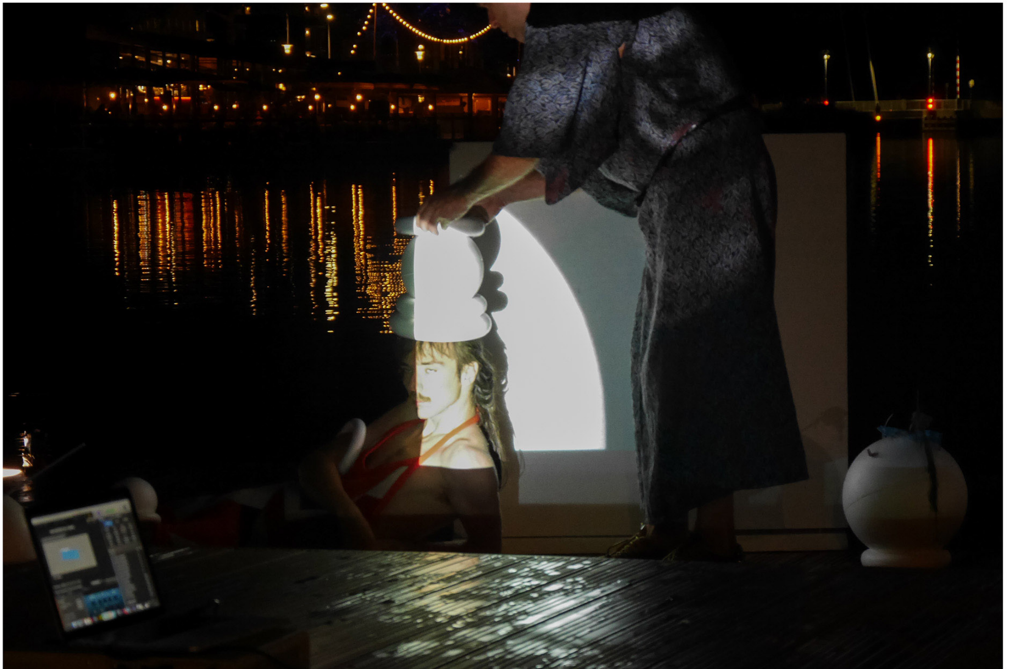
It is part XIX of an ensemble, and this ensemble is no longer necessarily ceremonial, 2020 performance in public space, Tilburg