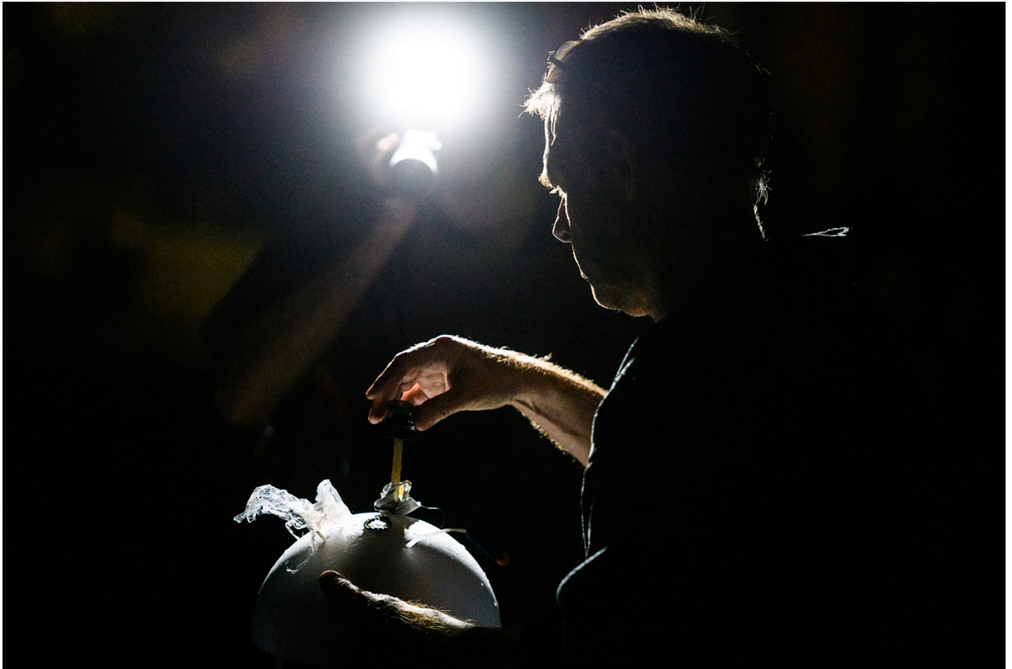
It is part XIX of an ensemble, and this ensemble is no longer necessarily ceremonial, 2020 performance in public space, Tilburg