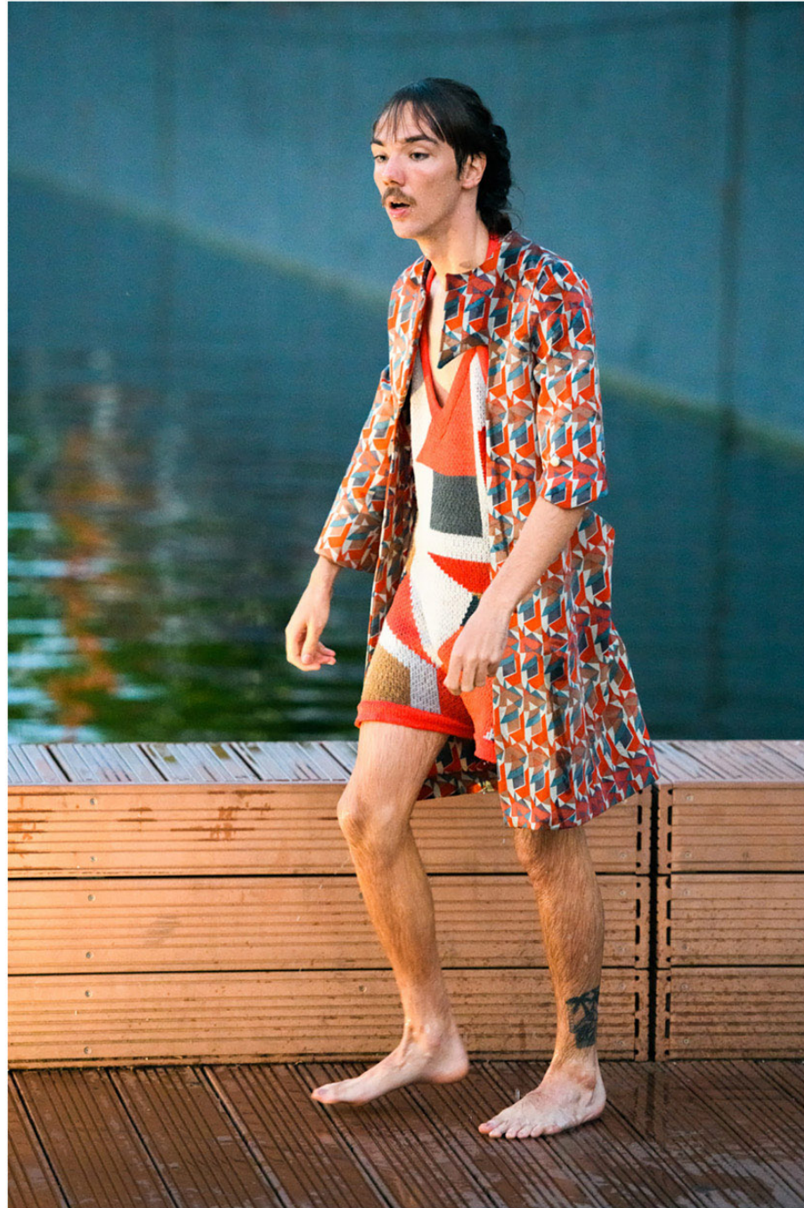
It is part XIX of an ensemble, and this ensemble is no longer necessarily ceremonial, 2020 performance in public space, Tilburg