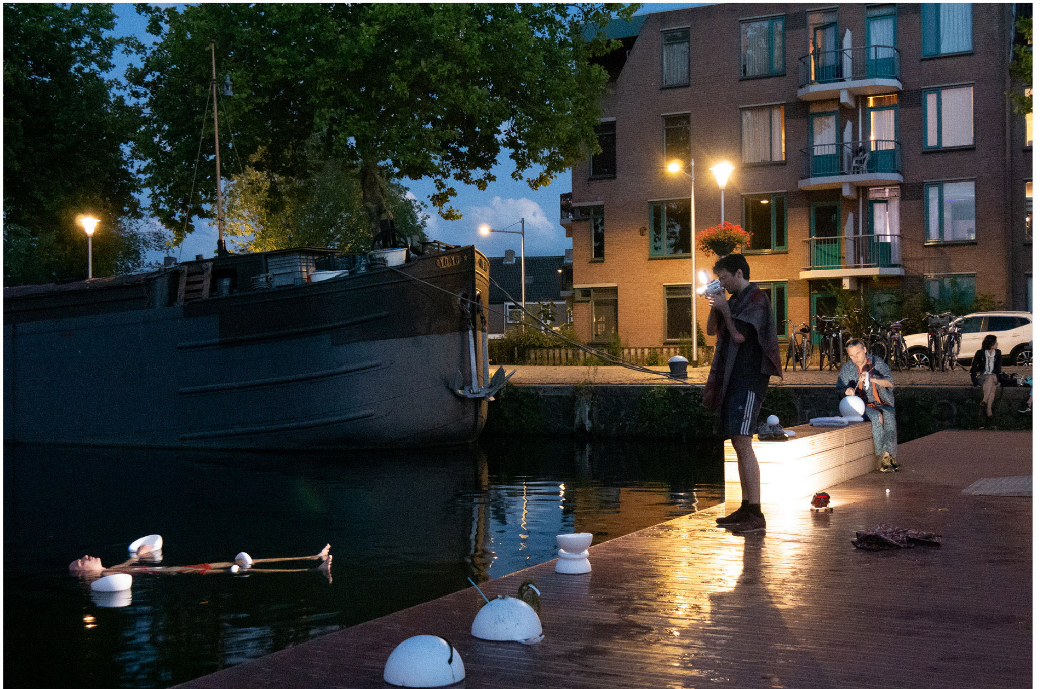
It is part XIX of an ensemble, and this ensemble is no longer necessarily ceremonial, 2020 performance in public space, Tilburg