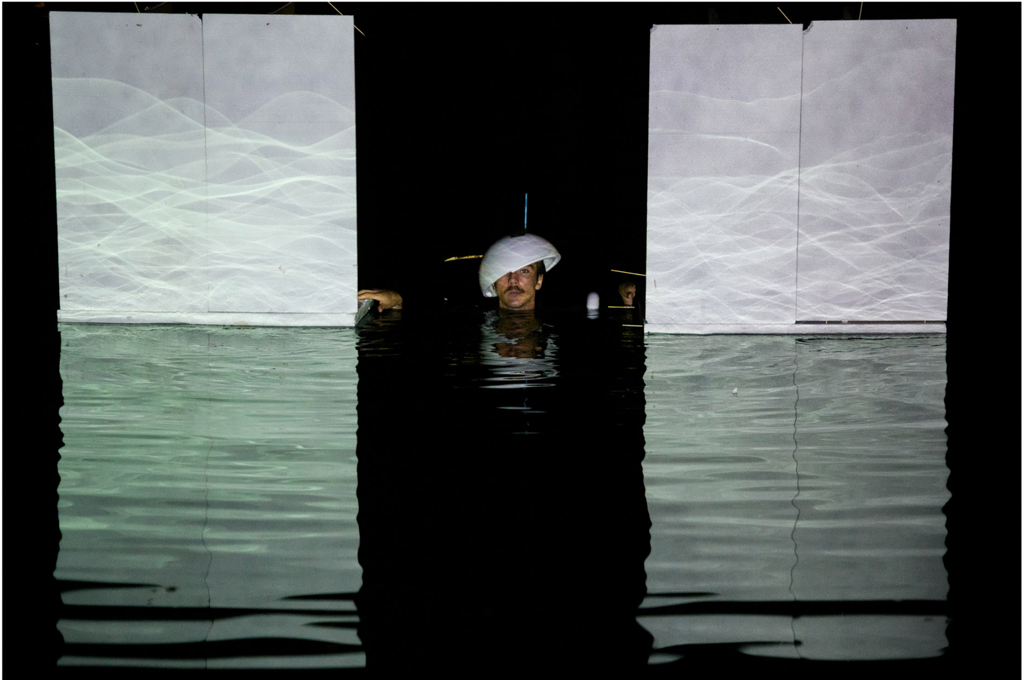
It is part XIX of an ensemble, and this ensemble is no longer necessarily ceremonial, 2020 performance in public space, Tilburg