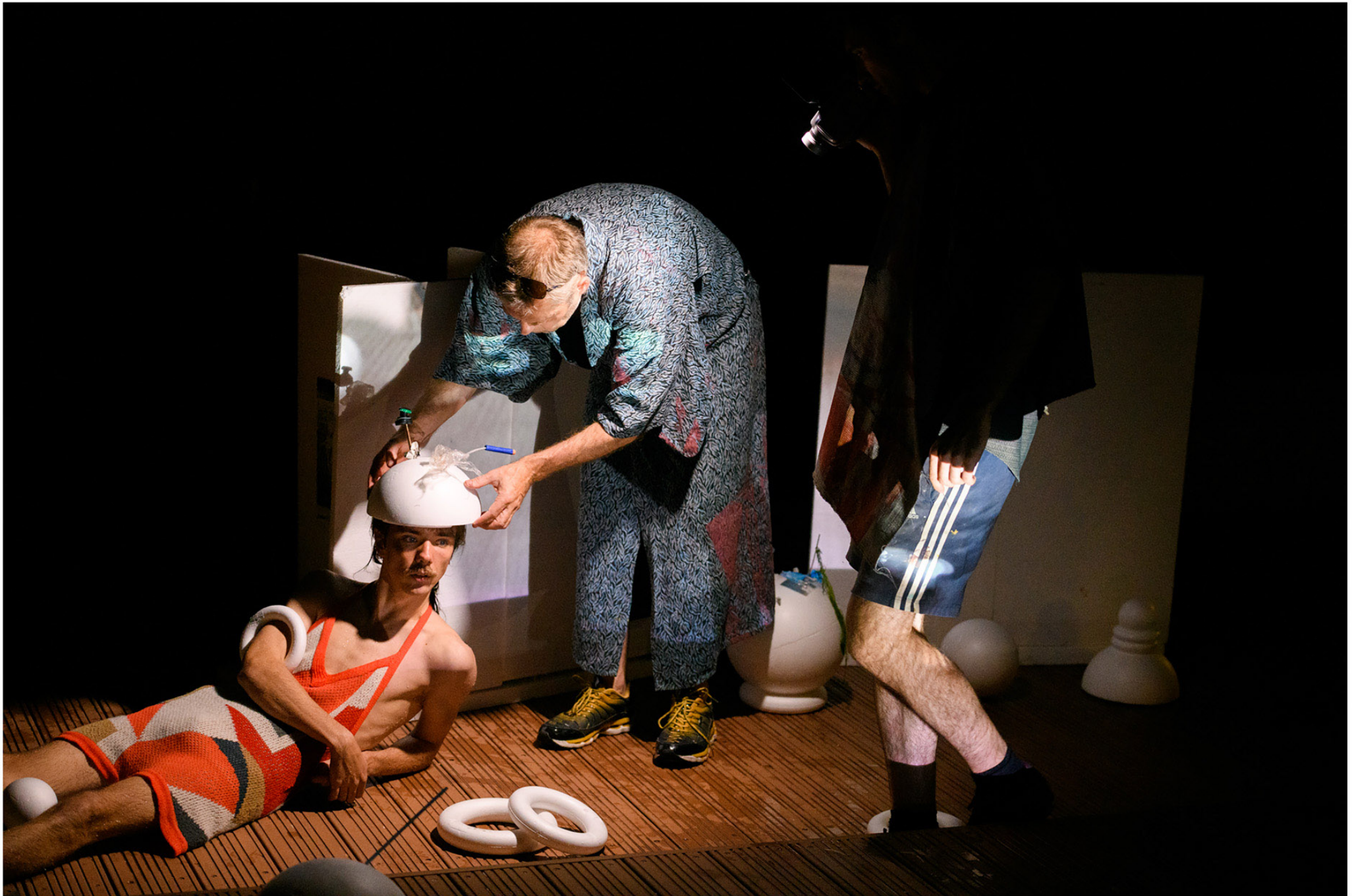
It is part XIX of an ensemble, and this ensemble is no longer necessarily ceremonial, 2020 performance in public space, Tilburg