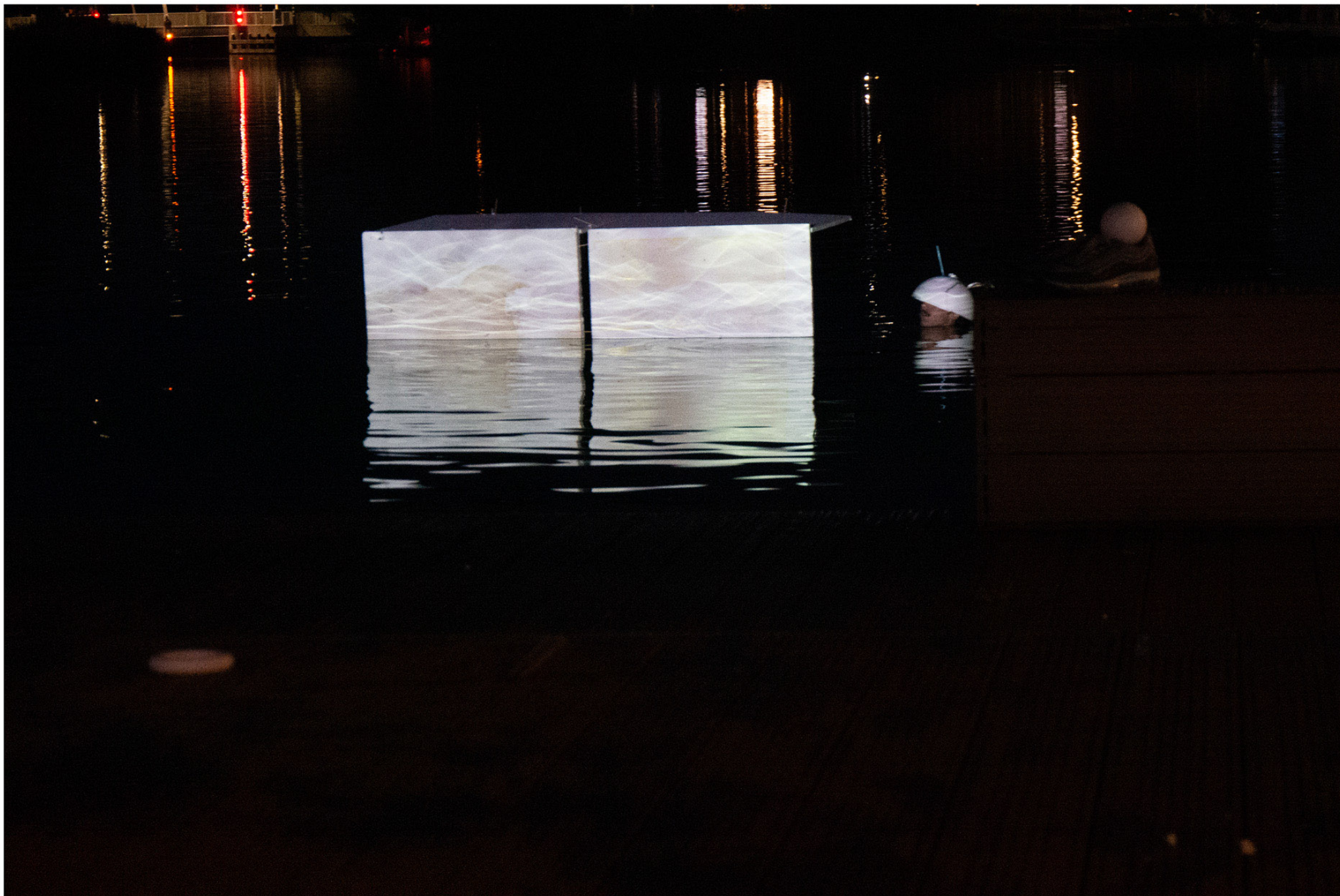
It is part XIX of an ensemble, and this ensemble is no longer necessarily ceremonial, 2020 performance in public space, Tilburg