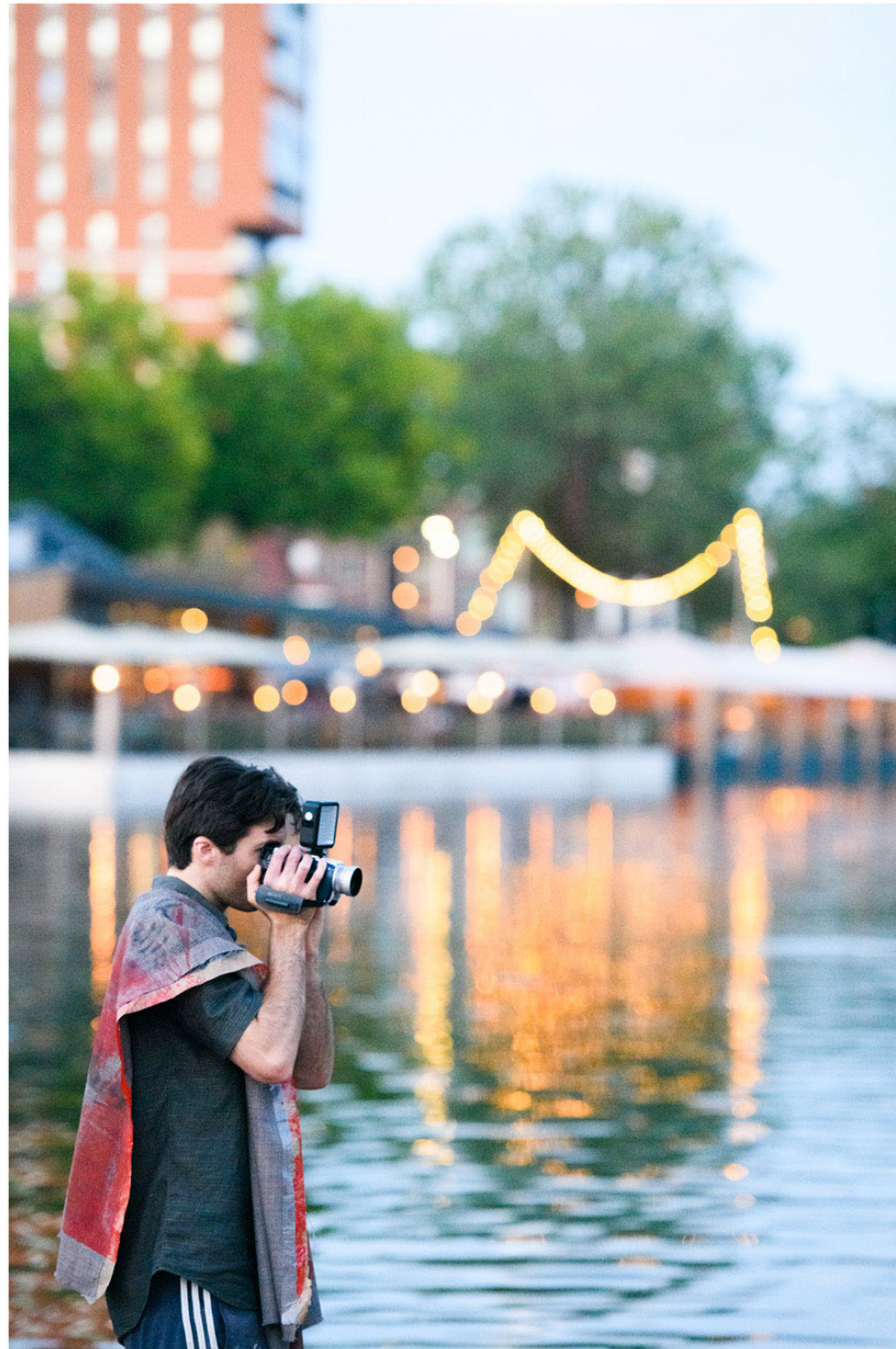
It is part XIX of an ensemble, and this ensemble is no longer necessarily ceremonial, 2020 performance in public space, Tilburg