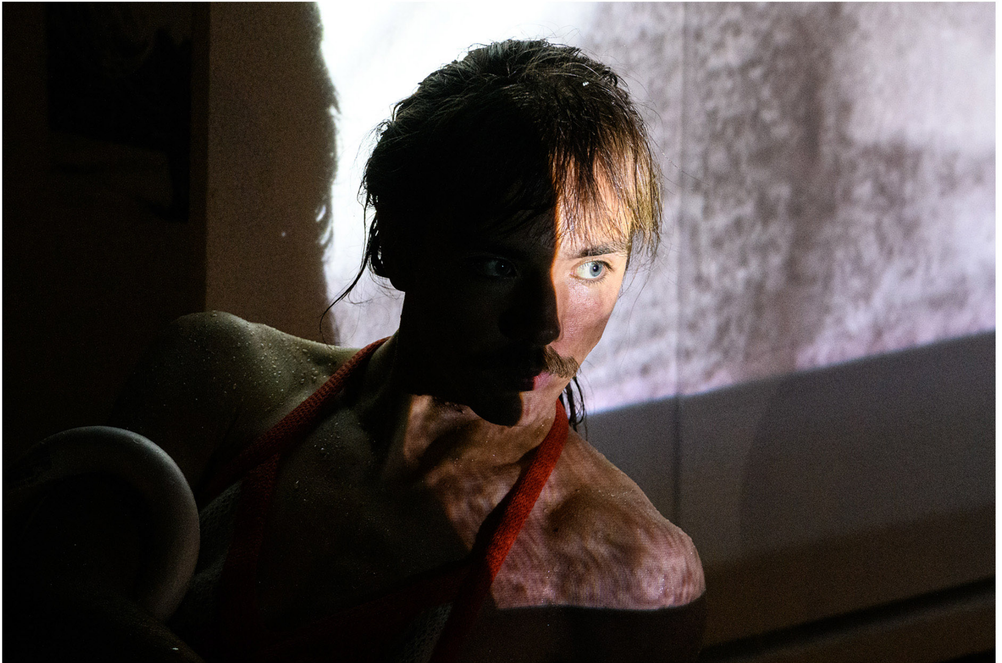
It is part XIX of an ensemble, and this ensemble is no longer necessarily ceremonial, 2020 performance in public space, Tilburg