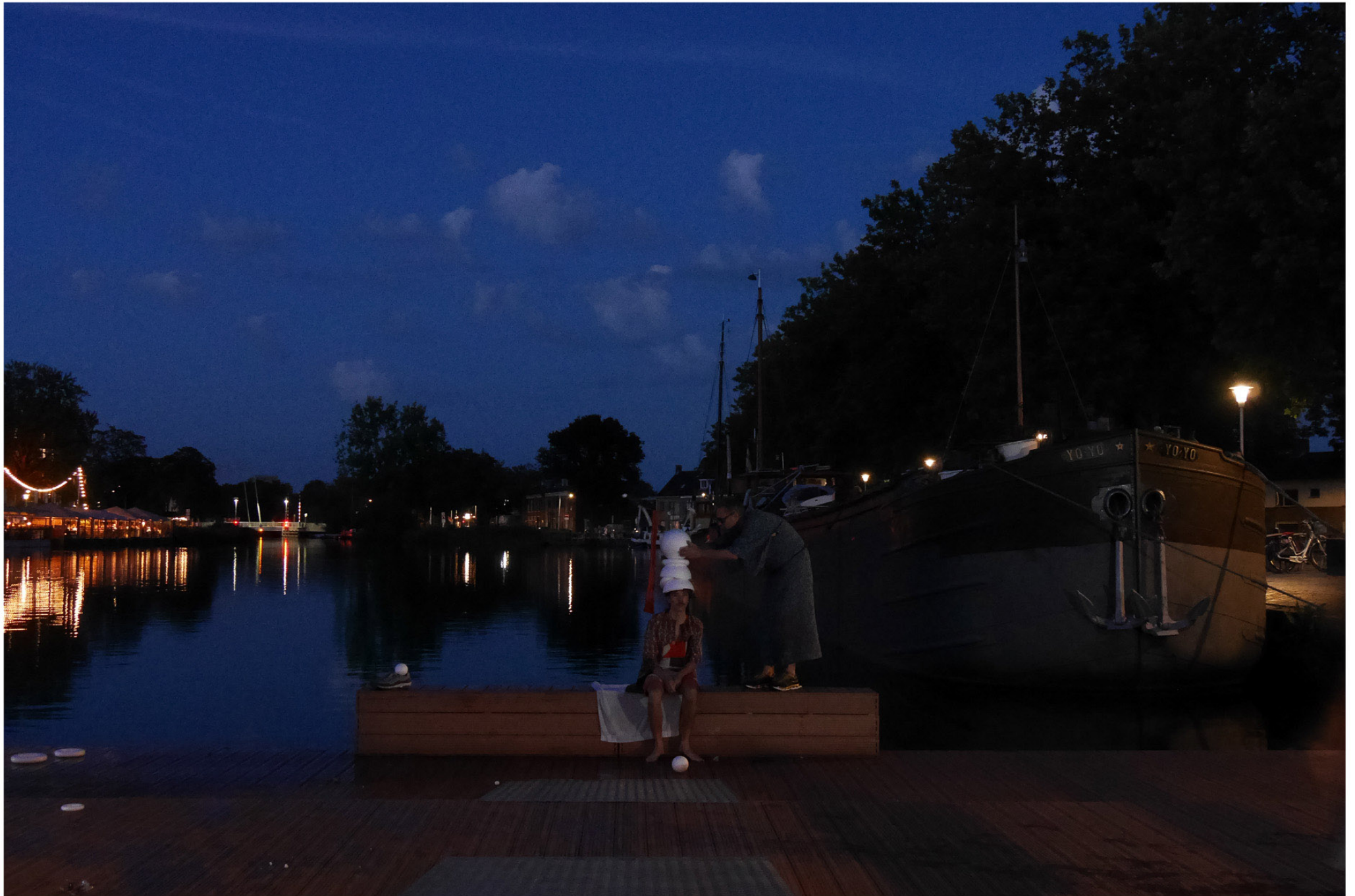
It is part XIX of an ensemble, and this ensemble is no longer necessarily ceremonial, 2020 performance in public space, Tilburg