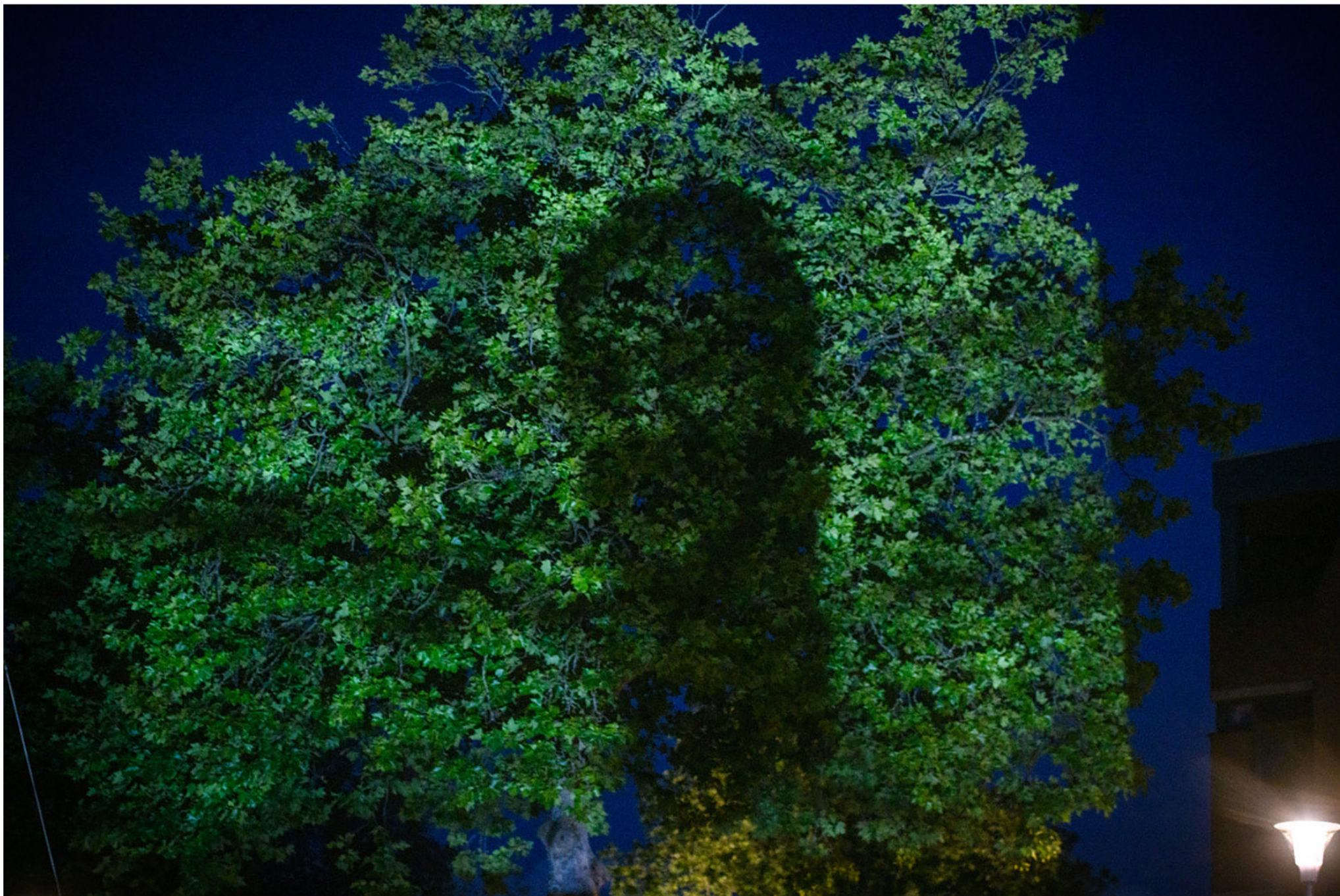
It is part XIX of an ensemble, and this ensemble is no longer necessarily ceremonial, 2020 installation view, Kunstpodium T, Tilburg