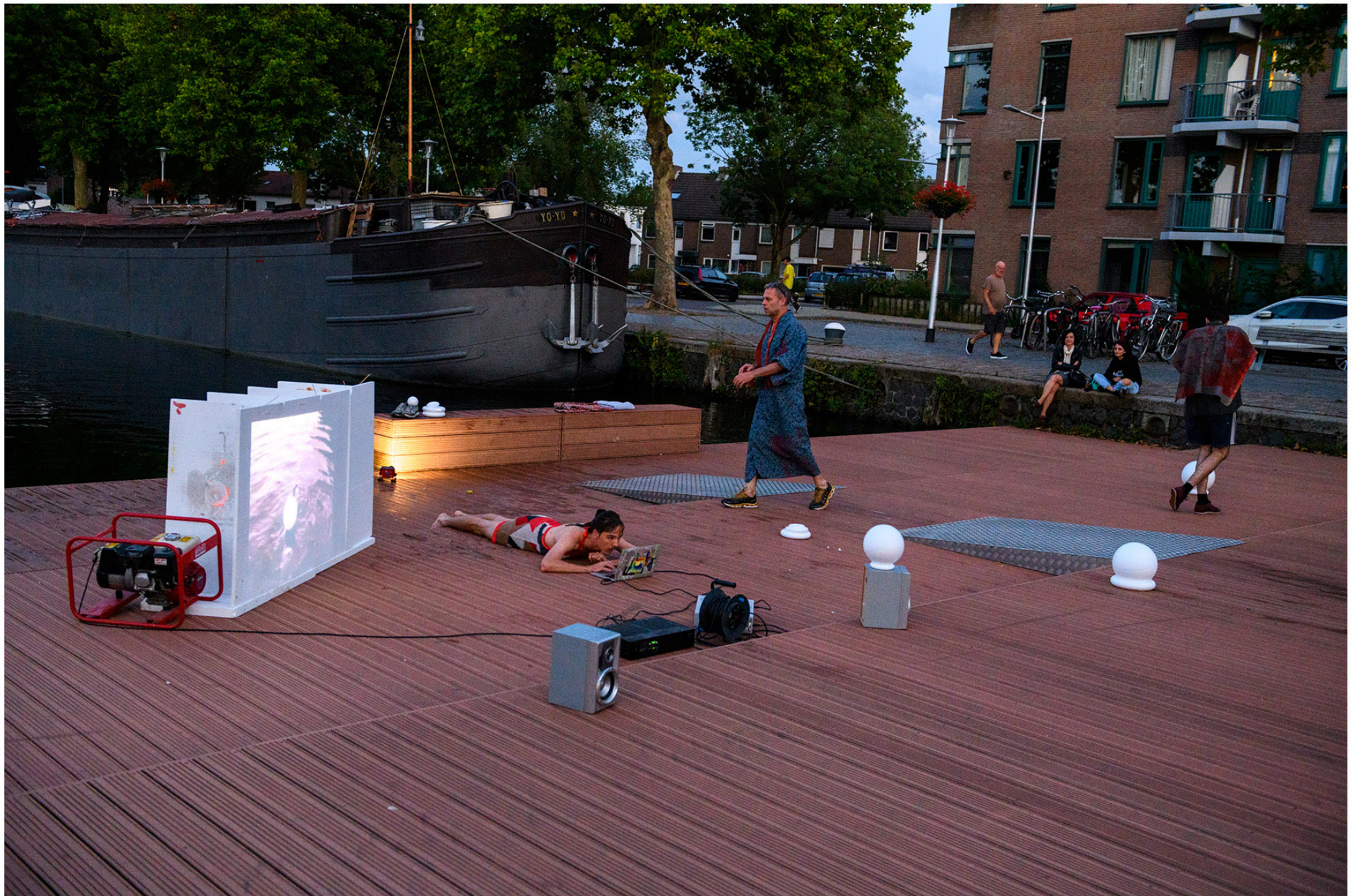
It is part XIX of an ensemble, and this ensemble is no longer necessarily ceremonial, 2020 performance in public space, Tilburg