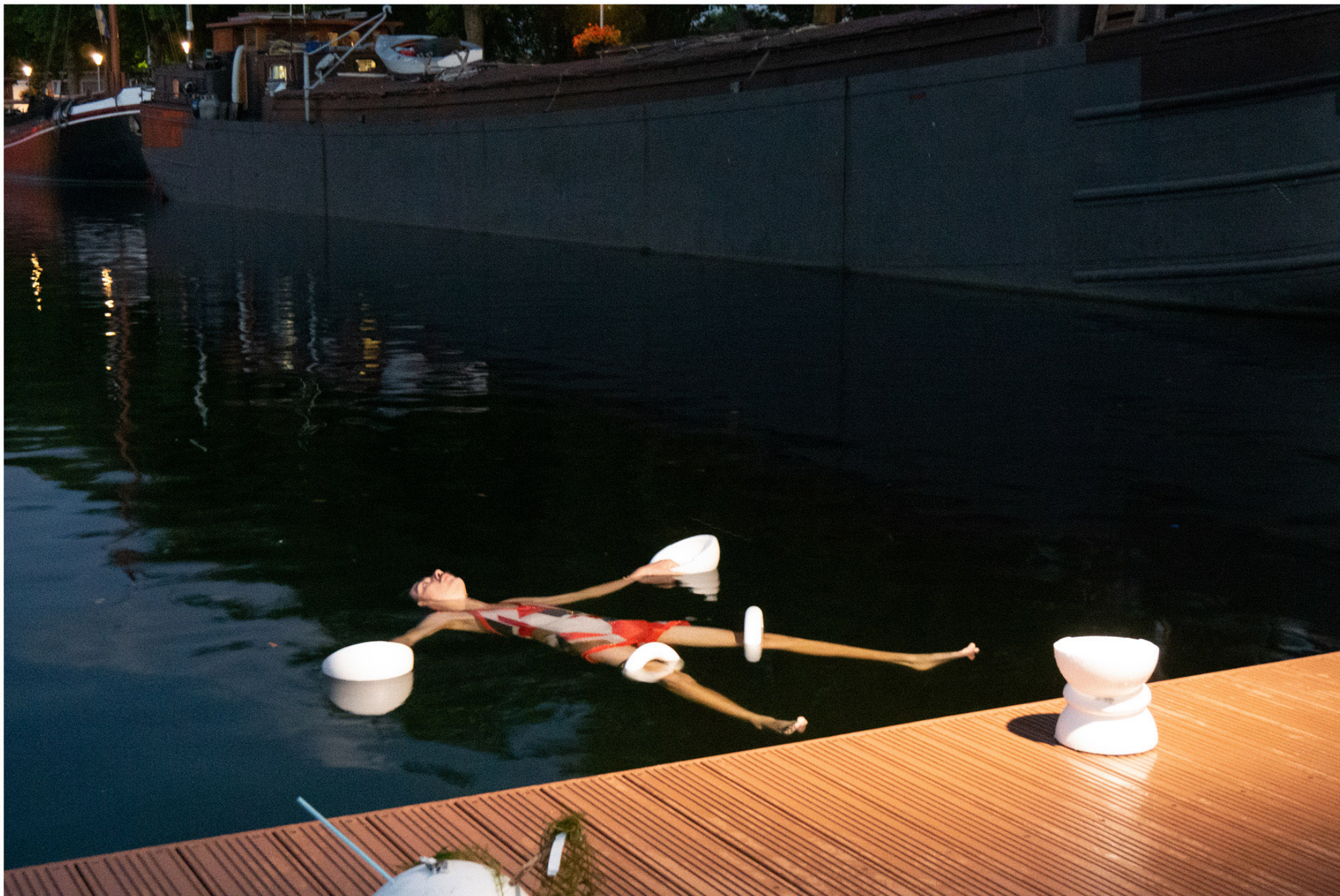
It is part XIX of an ensemble, and this ensemble is no longer necessarily ceremonial, 2020 performance in public space, Tilburg