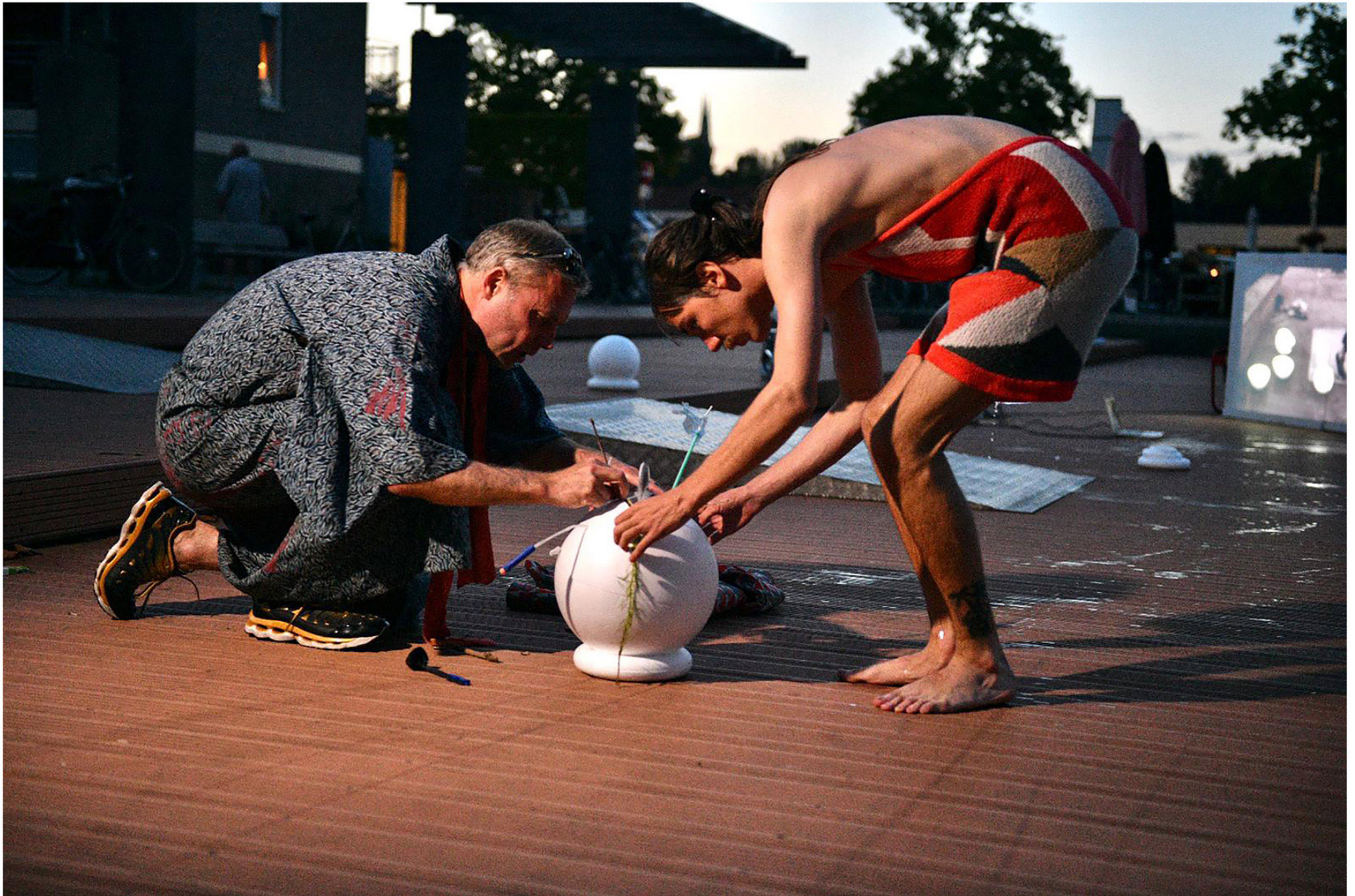
It is part XIX of an ensemble, and this ensemble is no longer necessarily ceremonial, 2020 performance in public space, Tilburg