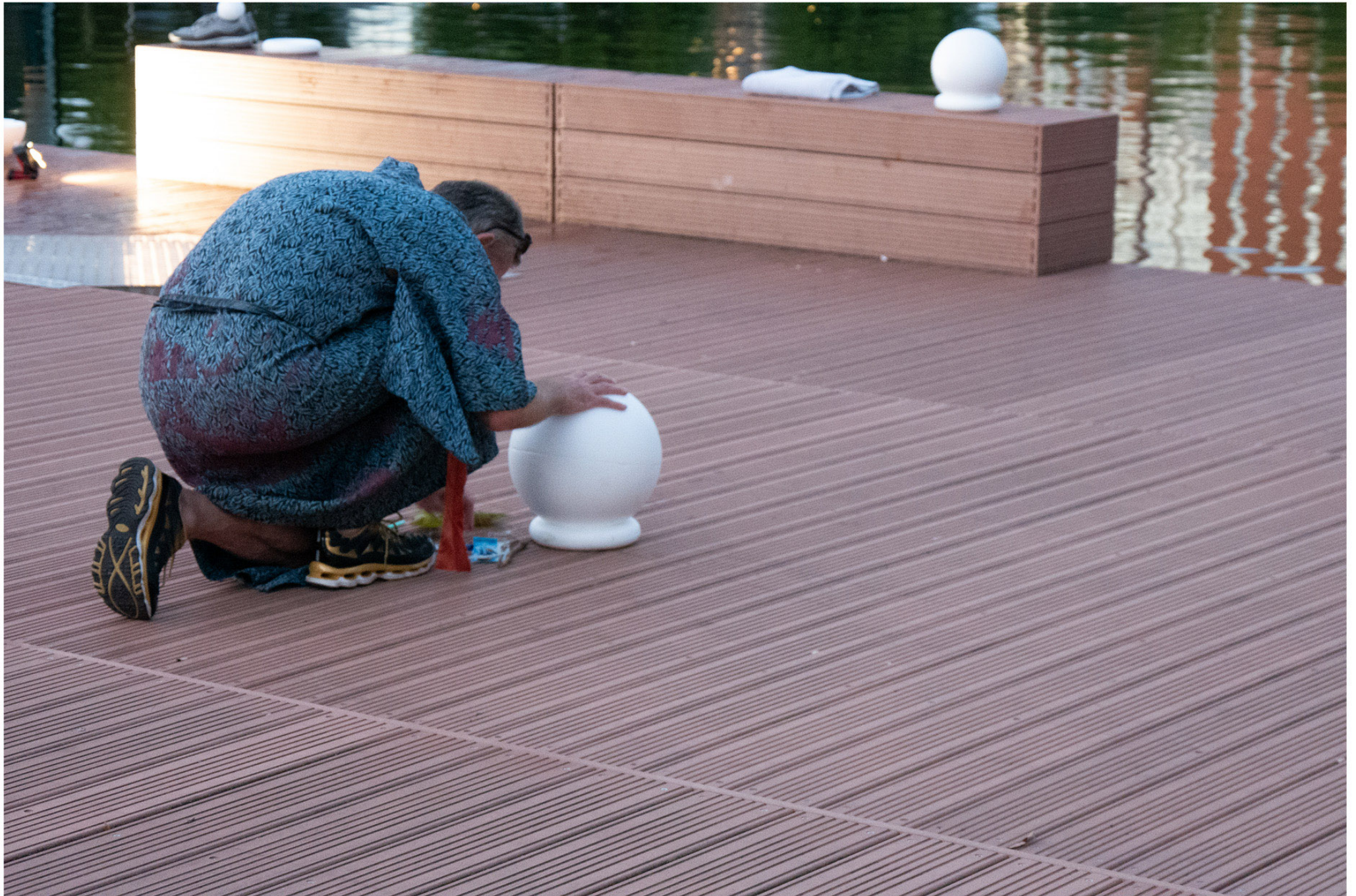
It is part XIX of an ensemble, and this ensemble is no longer necessarily ceremonial, 2020 performance in public space, Tilburg