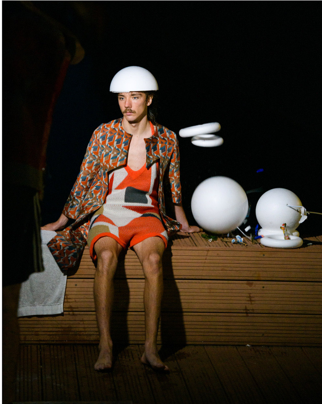
It is part XIX of an ensemble, and this ensemble is no longer necessarily ceremonial, 2020 performance in public space, Tilburg